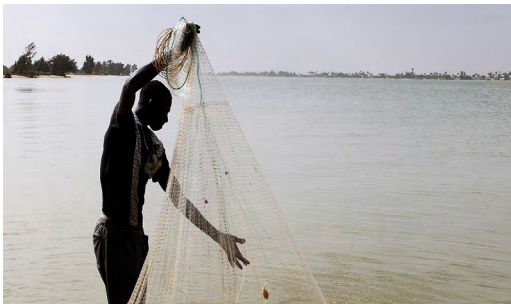
Increase small scale farmer, pastoralist and fisher folk income.