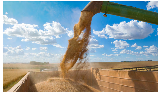
Increase agricultural output and value addition.