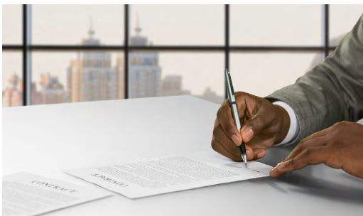
Support enabling policies aimed at improving skills, capacity & data provision.