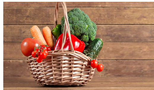
Improve household food resilience.